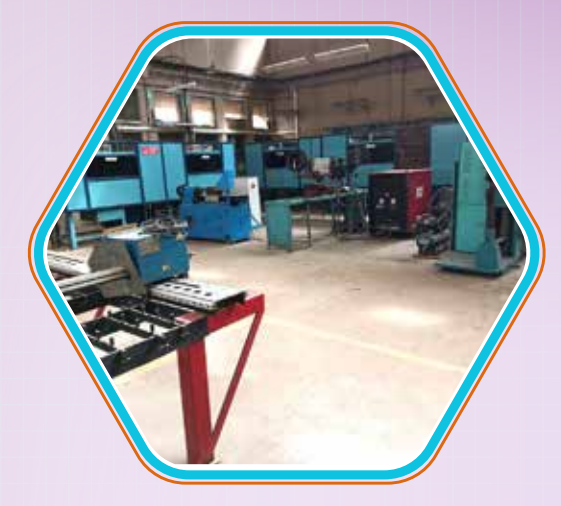
ADVANCED WELDING LAB