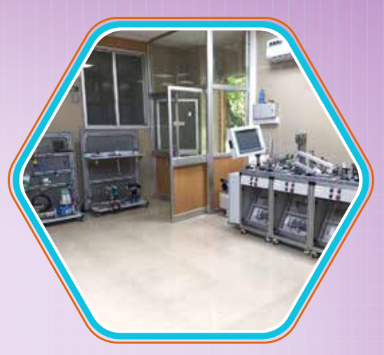
PROCESS CONTROL INSTRUMENTATION LAB