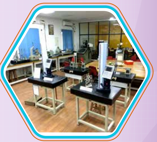
METROLOGY & ENGG.INSPECTION LAB